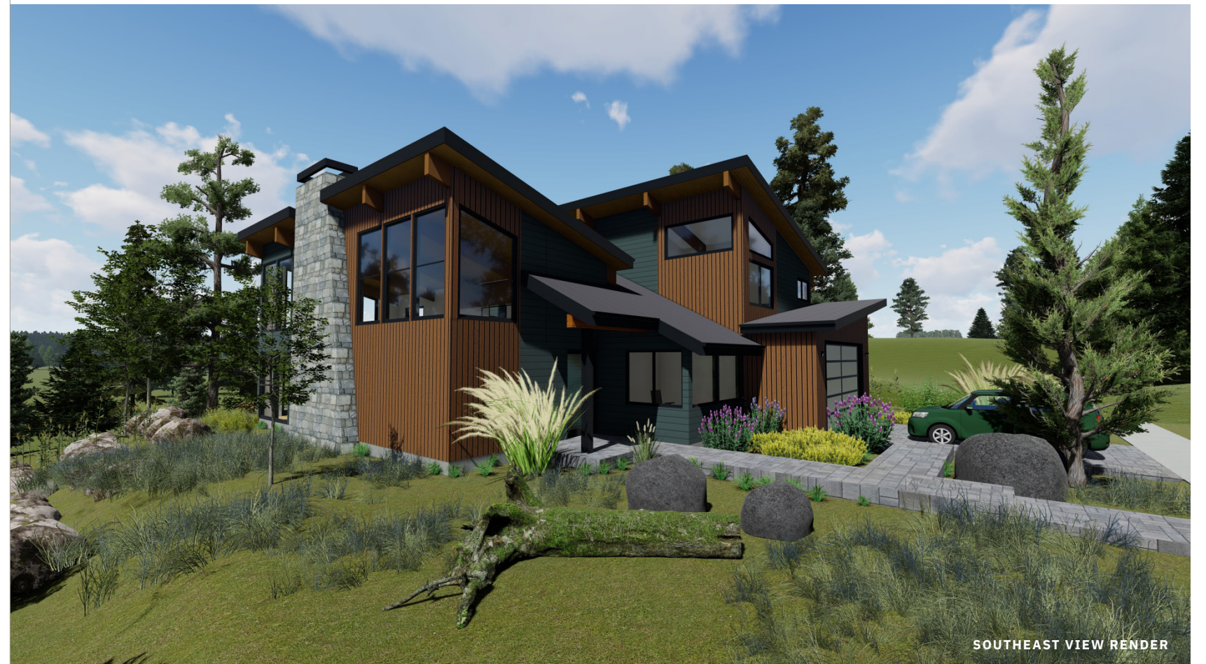
SOUTHEAST VIEW RENDER