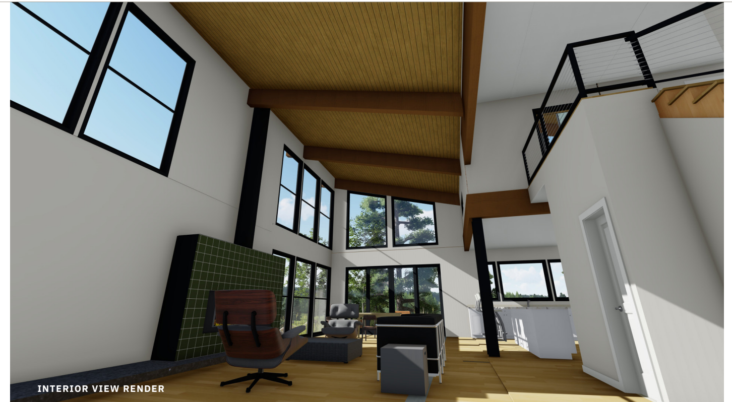
INTERIOR VIEW RENDER

“Deciphering and understanding a client’s varying needs – from goals, requirements, even hopes and dreams – is a very iterative, dynamic, and engaging process. I am passionate about interpreting what the clients express as their desires, and investigating creative pathways into the realization of a special architectural aspect, a particular design feature, and ultimately the entirety of the project.”