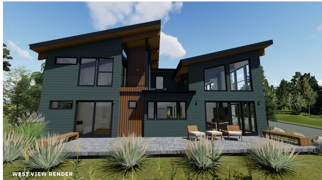
WEST VIEW RENDER