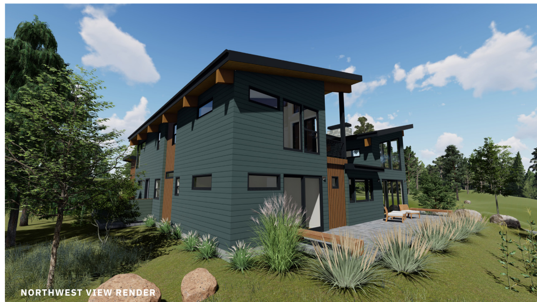
NORTHWEST VIEW RENDER

“Our methodology covers broad territory, and saves time and money.”